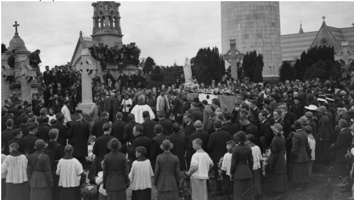
July 1922: The funeral of Cathal Brugha at Glasnevin cemetery in Dublin.