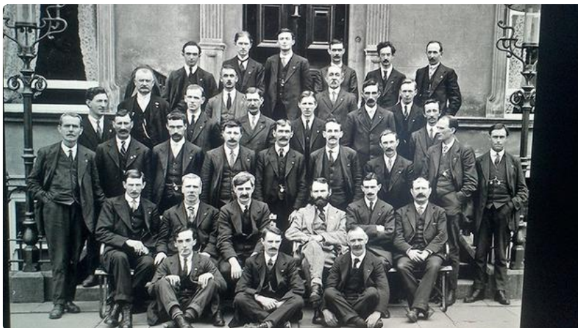
ITGWU officials in Waterford for the ITUC in 1918

Within three years, he would be organising agricultural labourers and county council roadmen in Carlow, Kilkenny, and Waterford. In the shipyard, he worked in an odd juxtaposition of Orangeism and militancy.